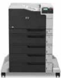
HP Color LaserJet Enterprise M750xh